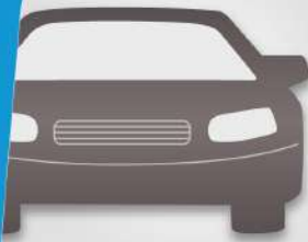
双色汽车零部件 Automotive Parts